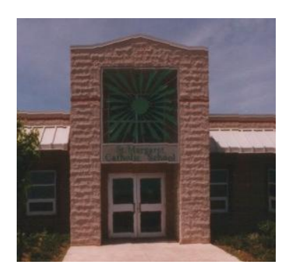
St. Margaret Catholic Elementary School Cambridge, ON

and design of a new culturally relevant independent school for 390 children in this isolated First Nations Community on the Coast of BC. Aspengrove School, Nanaimo, BC