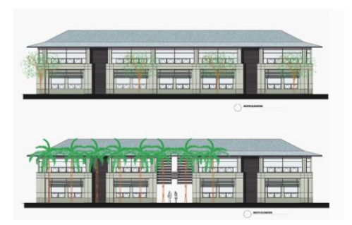
Island Pacific Academy Kapolei, Hawaii