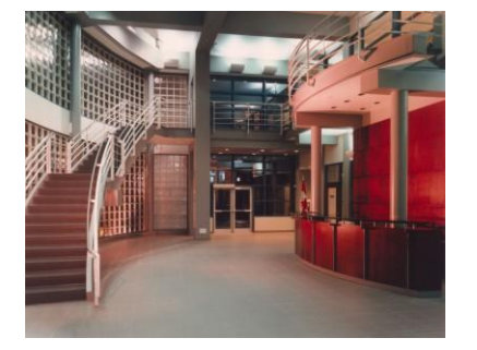
Innovation Centre University of British Columbia