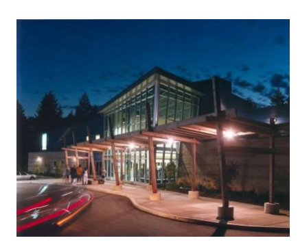
North Shore Ice Sports North Vancouver, BC