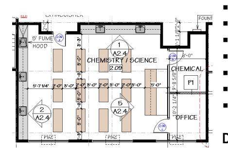
Southpointe Academy Tsawwassen, BC