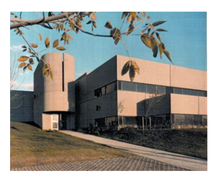
Bev Facey Composite High School Sherwood Park, AB

Architectural Institute of British Columbia Ontario Association of Architects Royal Architectural Institute of Canada American Institute of Architects Manitoba Association of Architects Alberta Association of Architects