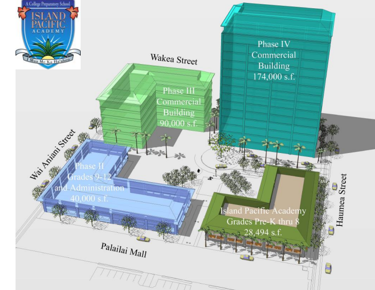
Island Pacific Academy, Development Concept

HEG understands the obstacles that founders and land developers face when dealing with the overwhelming challenges of conceptualizing and starting a private school in a new city. We propose to work closely with you in your endeavors to provide education solutions to your community, developing the critical strategies and recommendations needed to start your school with an