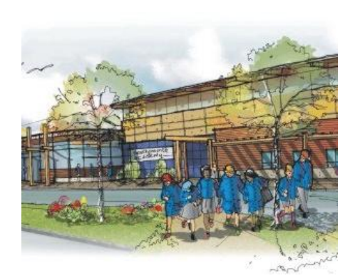
Southpointe Academy Tsawwassen, BC